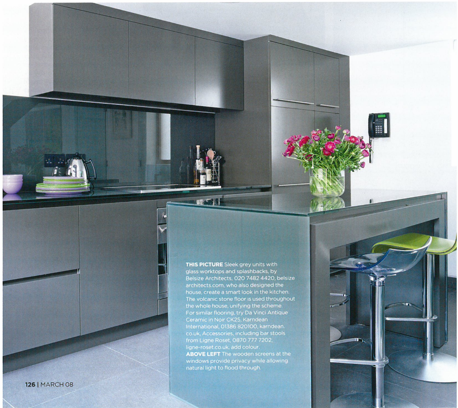
THIS PICTURE Sleek grey units with glass worktops and splashbacks, by Belsize Architects, 020 7482 4420, belsizearchitects.com , who also designed the house, create a smart look in the kitchen. The volcanic stone floor is used throughout the whole house, unifying the scheme. For similar flooring, try Da Vinci Antique Ceramic in Noir CK25, Karndean International, 01386 820100, karndean.co.uk . Accessories, including bar stools from Ligne Roset, 0870 777 7202, ligne-roset.co.uk , add colour. ABOVE LEFT The wooden screens at the windows provide privacy while allowing natural light to flood through.