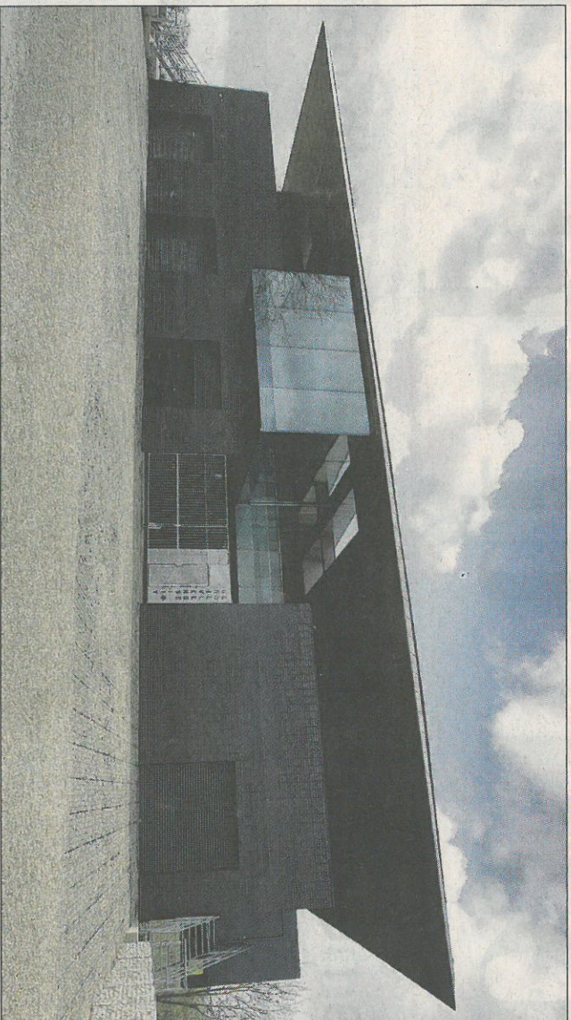
■ RECOGNISED: Oxford's University College's boathouse has received a commendation in the Civic Trust Awards for being among the best new buildings and renovations in the country. The £2.7m structure, off Abingdon Road, which opened in 2007, replaced a listed boathouse that was destroyed by fire

He was cleared of a further charge of indecent assault by a jury after a trial at Oxford Crown Court in January.