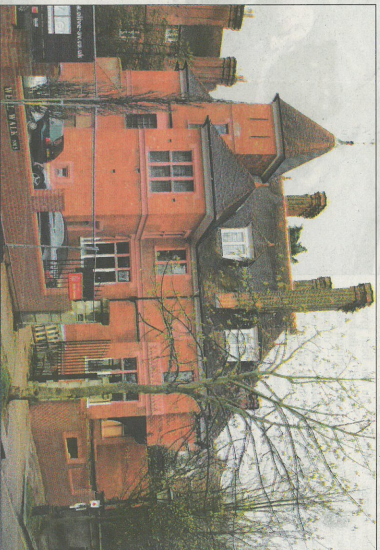
Klippan House, which is in a conservation area of Hampstead, is set to be extended underground

The inspector said: "The spatial qualities of the house would remain visibly unaltered. Everything would be constructed underground with almost no visible presence on the site except air terminals." The inspector added that a mature cedar tree –