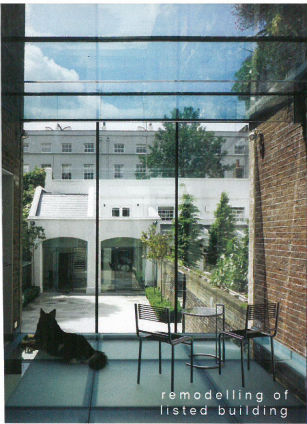
remodelling of listed building