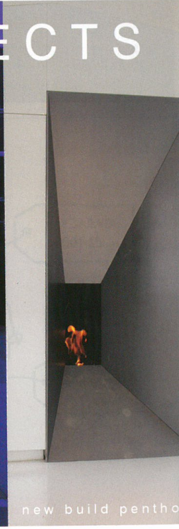
new build pentho

RIBA award -winning architects, specialising in high-end residential development, (both remodelling and new build).