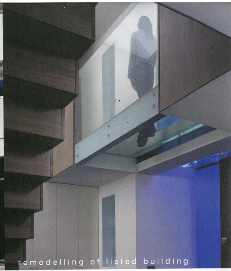
remodelling of listed building