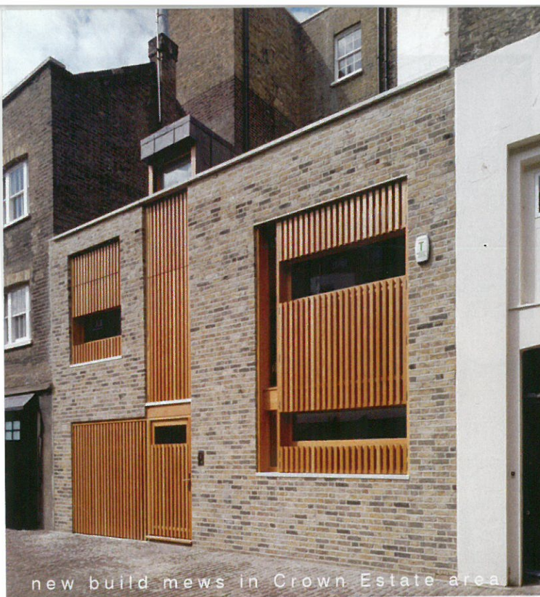
new build mews in Crown Estate area