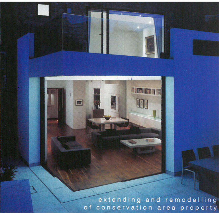
extending and remodelling of conservation area property