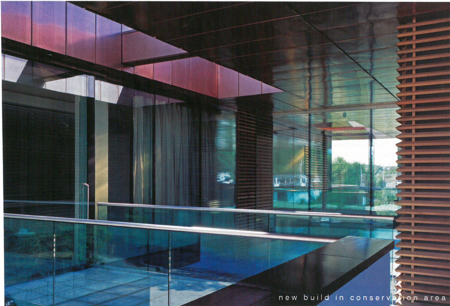
new build in conservation area