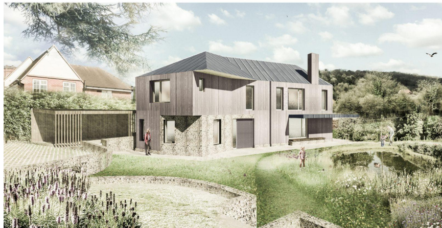
1/10 Belsize Architects' Monkey Lodge scheme in the Chilterns

Belsize Architects is to demolish a two-storey detached house in the Chilterns Area of Outstanding Natural Beauty and build a largely timber replacement